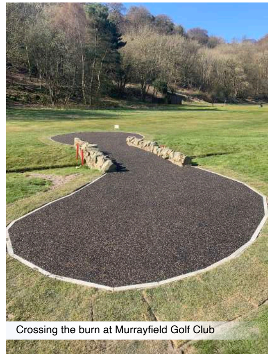
Crossing the burn at Murrayfield Golf Club