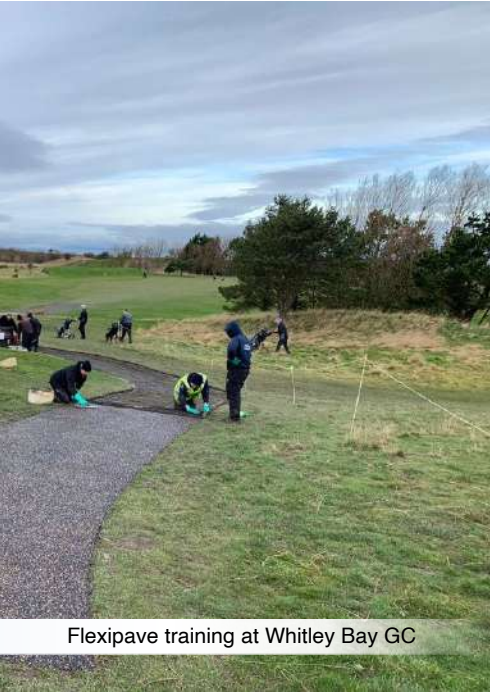
Flexipave training at Whitley Bay GC