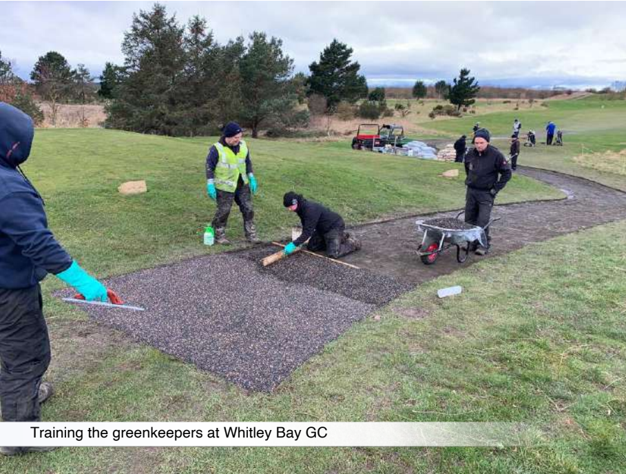
Training the greenkeepers at Whitley Bay GC