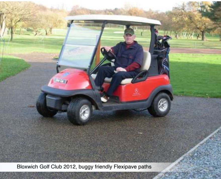
Bloxwich Golf Club 2012, buggy friendly Flexipave paths