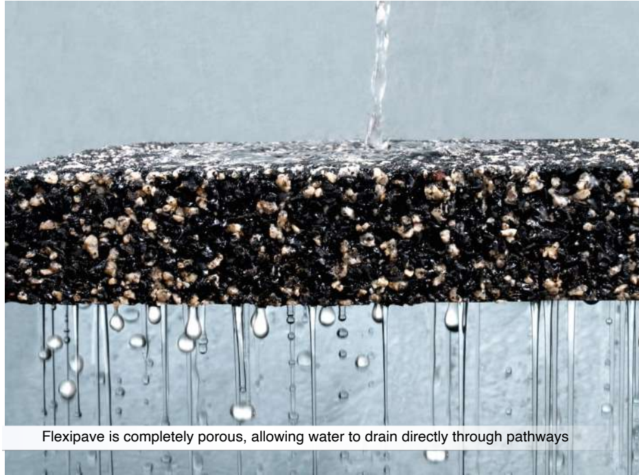
Flexipave is completely porous, allowing water to drain directly through pathways