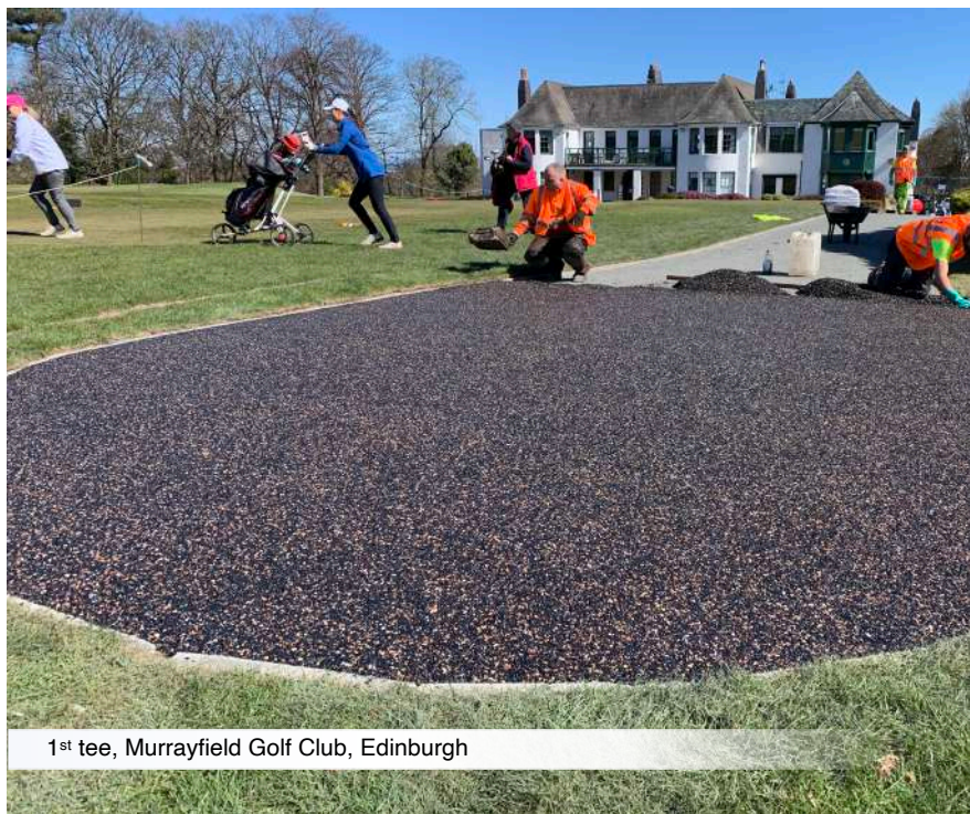
1 st tee, Murrayfield Golf Club, Edinburgh