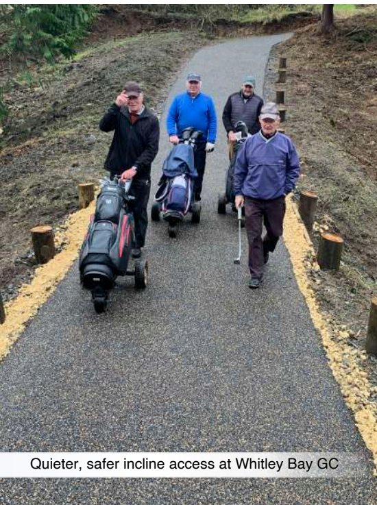
Quieter, safer incline access at Whitley Bay GC