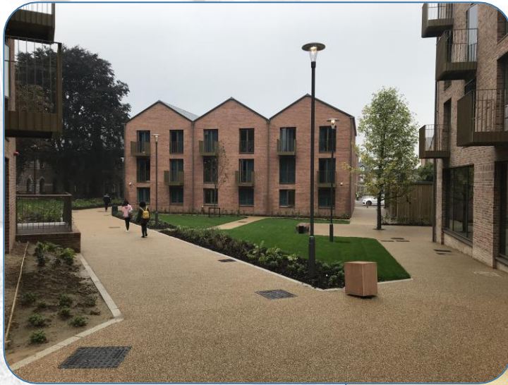
Above: Large communal open areas formed a key feature of the project, making a porous paving solution critical to creating safe access and maintaining the presentation all year round.

Below: The city of York has been a big advocate of cycling, investing heavily in new cycle paths. The use of KBI Flexistone to create cycle access to the Vita York development was a key element.