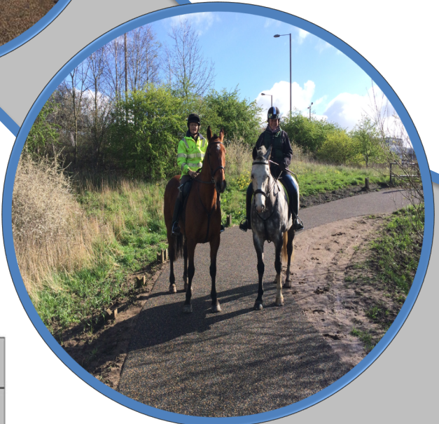
TPT auto visitor counts - Royston

BMBC has been closely monitoring the re-laid sections of the trail and have recently published the following graph to highlight the increased usage experienced on the Royston stretch.