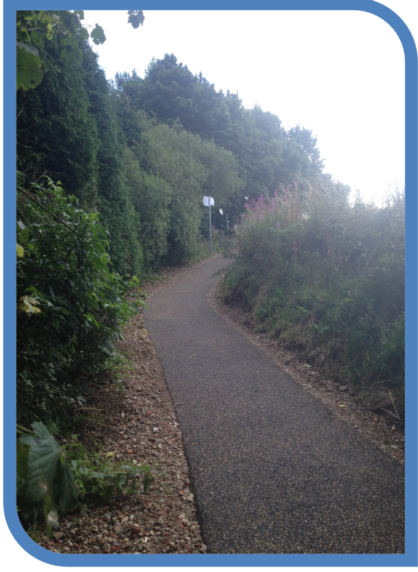
The finished bridleway conforms to the natural contours of the original path and is completely porous. The recycled rubber used within the material not only makes it eco-friendly, it reduces the impact on the leg joints of the horses using the bridleway.